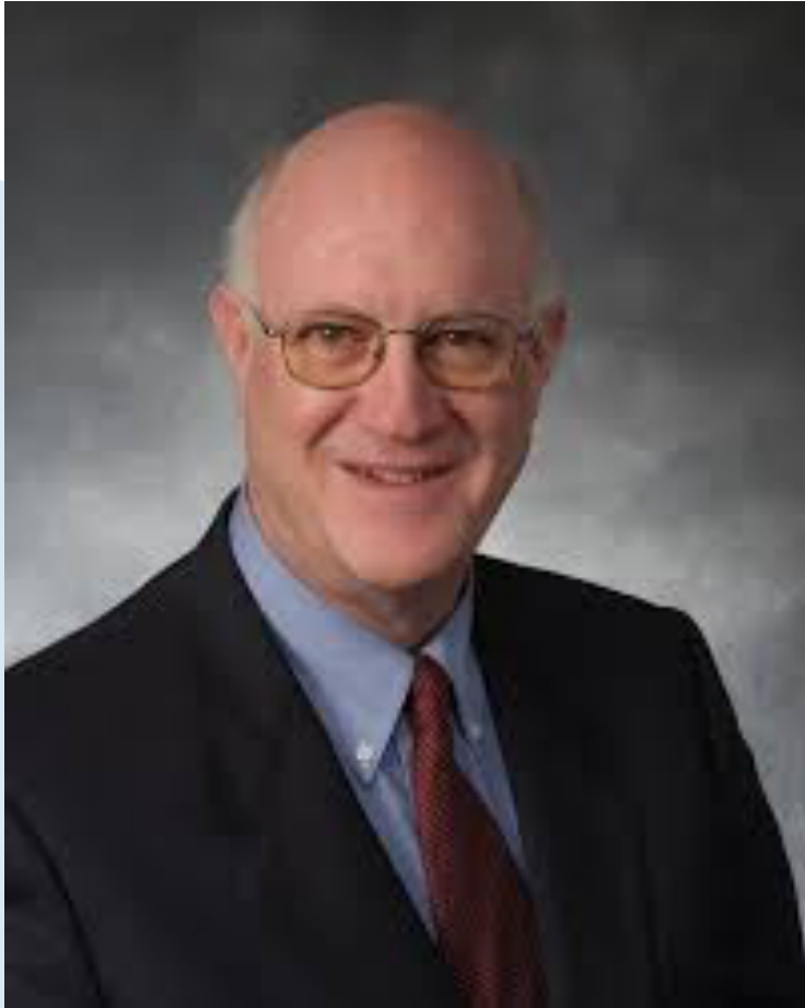
Steve Crocker Chair, ICANN Board of Directors